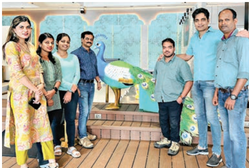
बंदर कप्तान कार्यालयातील कर्मचारी.