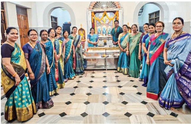
भाटले येथील श्री राम मंदिरात नवरात्रोत्सवानिमित्त महिला वर्ग.