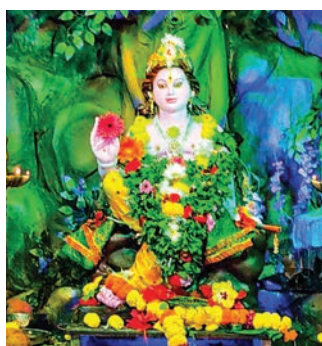
ब्राह्मवाठार देवस्थान म्हापसा कृष्ण पूजन.