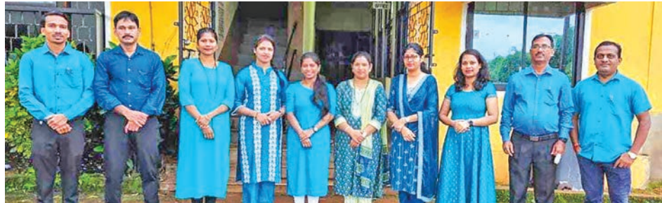
श्री महालक्ष्मी हायस्कूल कुडणे स्टाफ.