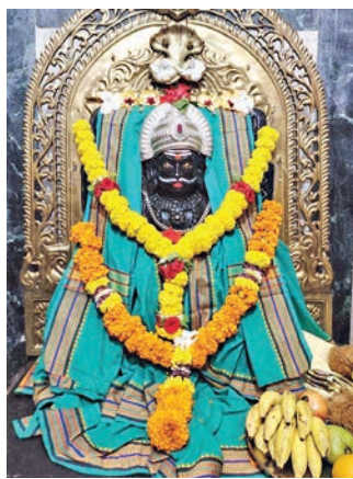
डिचोली बोर्डे येथील श्री देव स्वळनाथ.