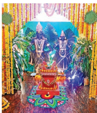
अडकोण बाणस्तारी येथे श्री महिषासुर मर्दिनी देवस्थानात केलेला विठ्ठल रखुमाईचा देखावा.