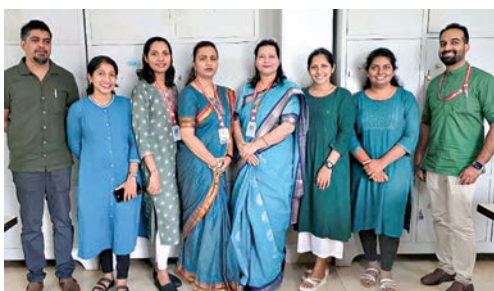
म्हापसा येथील सेंट ब्रिटो स्कूलचे शिक्षक व कर्मचारी.