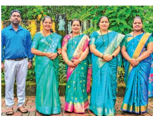
खरपाल येथील सरकारी प्राथमिक शाळेचा शिक्षकवर्ग.