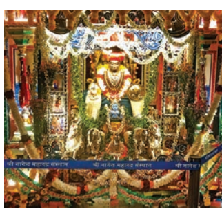
नागेशी येथे नवरात्रीनिमित्त मखरात बसलेले श्री नागेश महारूद्र.