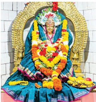
डिचोली बोर्डे येथील श्री देवी महामाया.

सावर्डे : श्री नागनाथ बेताळ सांतेरी पंचायतनात नवरात्रोत्सवातील दसरा उत्सव विजयादशमी २ ऑक्टोबर रोजी संध्या. ६ वा. साजरा करण्यात येईल. यावेळी श्री बेताळ मंदिरात अवसर व कोलप्रसाद होईल. तरी सर्व महाजन, कुळावी, ग्रामस्थ व भाविकांनी उपस्थित राहून कोलप्रसादाचा लाभ घ्यावा, असे आवाहन देवस्थान समितीतर्फे करण्यात आले आहे.